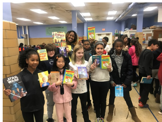
Students showing the books they received during RIF

For more information on how you can help contact aroniminkhomeandschool@gmail.com . You can also check out the Aronimink Home and School Association Facebook page.