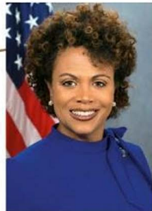
164th Legislative District

Upper Darby One Center 100 Garrett Road Upper Darby, PA 19082